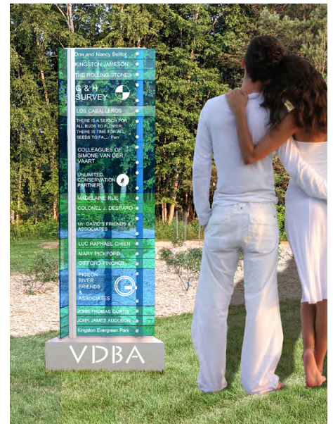
Artist rendering of the planned Donor Pylon.