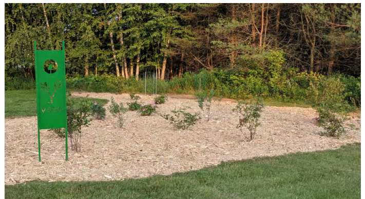
Bird Garden #1 at the Southeast Quadrant of the Arboretum.

A complimentary planting program is also underway—the establishment of Bird Gardens. These gardens are intended to be massed thickets of "bird berries" and other forage and habitat-producing plants. Two have been established on site to complement the Franciscan Gardens. (continued on page 2)