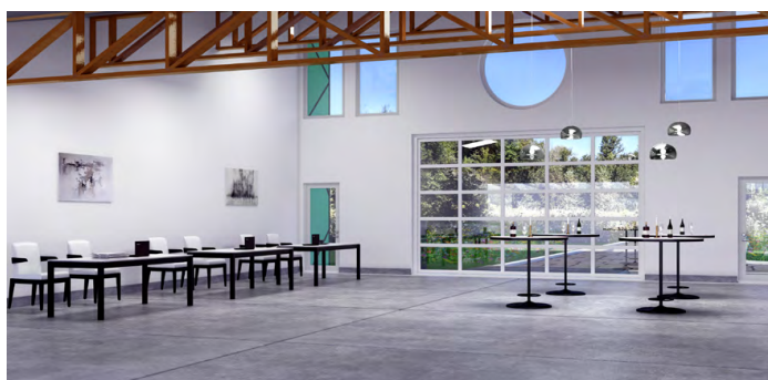
Exterior and interior renderings of the proposed VDBA Propagation Center.