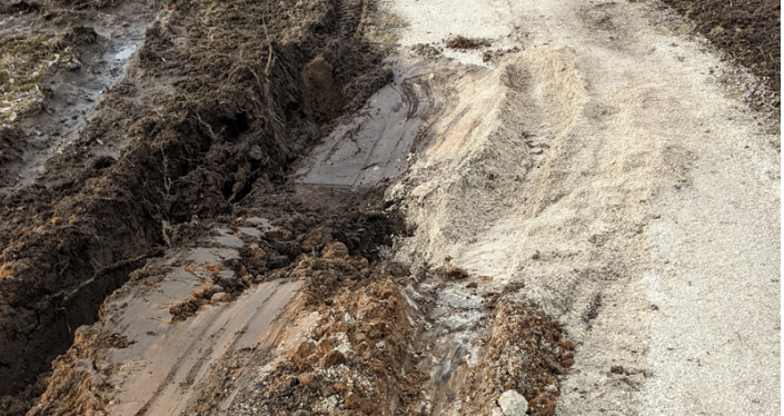
Top and middle: Volunteers and supporters Genny Shields and Mike Knotek water the newly planted trees. Bottom: A walking trail temporarily damaged by construction work at the Arboretum.