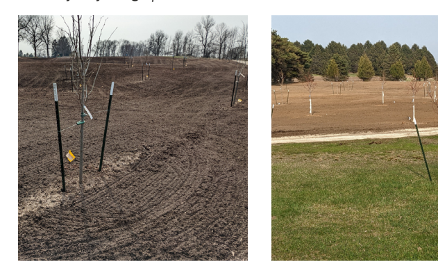
Left: Linden Grove. Right: Maple Grove.