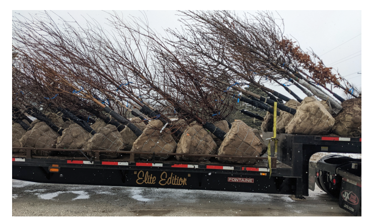
A delivery of trees.