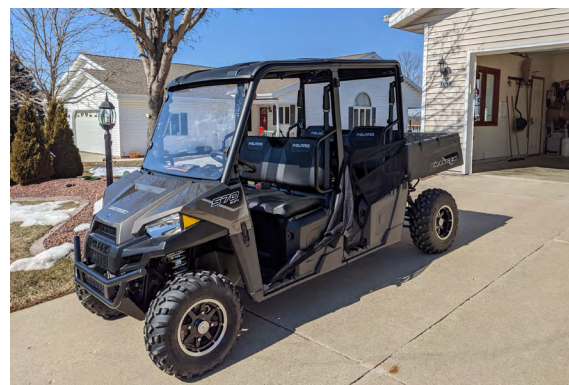
The newly donated VDBA Utility Terrain Vehicle.